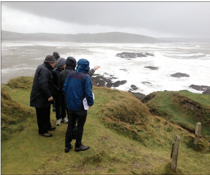
Panel members on site (in stormy weather)

'SWDRP was a great supporter of our project. They offered excellent advice on how to develop the design within the context of the AONB policies, and through detailed insight of our scheme, were unquestionably useful in supporting the design quality of the proposal.'